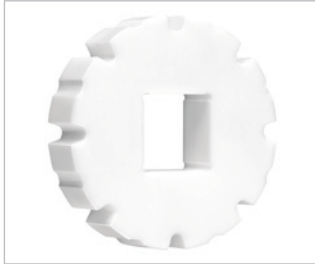
Sprockets Habasit Cleandrive™ series