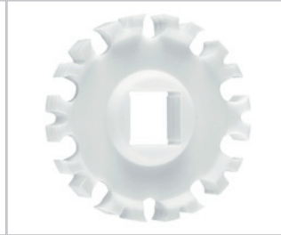
Sprockets Habasit Cleandrive™ HyCLEAN series